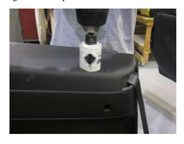
REVISION DATE: ISSUE DATE: 05/26/11